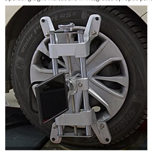
10"-21" Self-centering wheel clamps with 26" extender brackets

SUPERIOR QUALITY CAMERA Latest generation high-resolution HI-Q camera for artificial vision. Operating Light Indications in integrated synoptic panel.