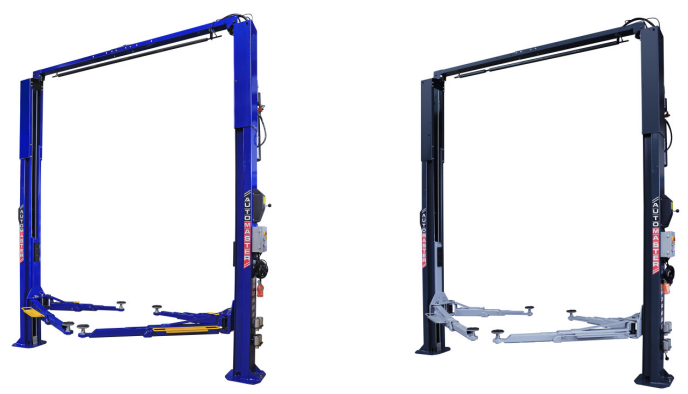
Available in Dark Blue (5002) or Dark Grey (7016) Colours