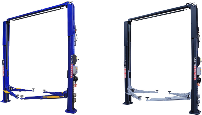
Available in Dark Blue (5002) or Dark Grey (7016) Colours