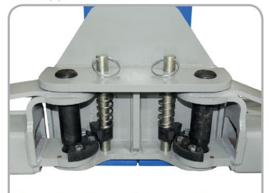
Our automatic arm locks are fully approved, tested and safe. Automatically disengage when the lift is lowered