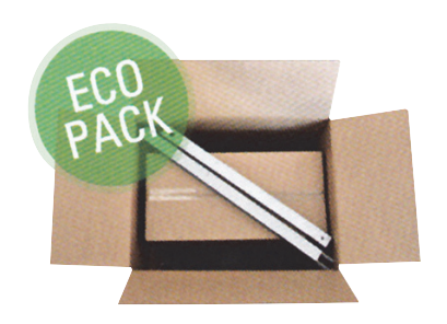
1pc. cm 60 x 80 x 50h 1 Box